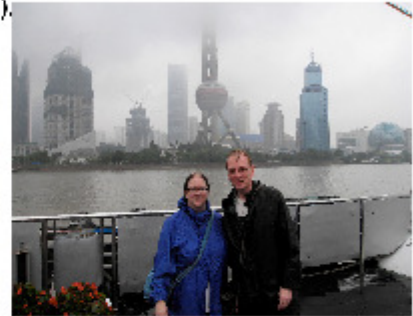
Pu Dong, Shanghai.

Shanghai: Jade Buddha Temple, Yu Yuan Gardens, Huang Pu River, Nanjing Road