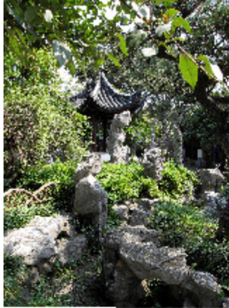
Lingering Garden, Suzhou.

Suzhou: water towns of Zhujiajiao and Tongli, silk factory, silk embroidery institute, Lingering Garden, Humble Administrator's Garden, Master of Fishing Nets Garden